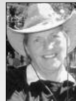
By Cheryl Mickunas

"I can't depend on New Year's resolutions to maintain a lifestyle."